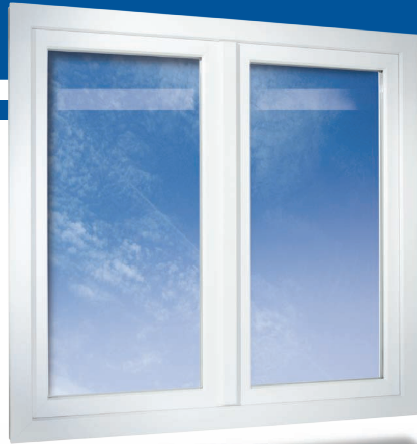
Twin Window with loose mullion recessed sash